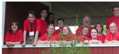
CCAAPS Study Team