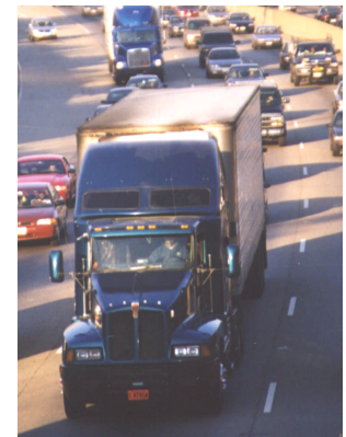
Funded by NIEHS Grant: ES11170