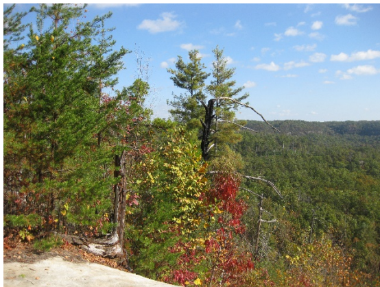
Red River Gorge