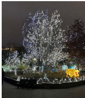
Cincinnati Zoo Festival of Lights

Cincinnati Zoo & Botanic Gardens (home to Fiona!) is one of the oldest zoos in the United States and ranked the #1 zoo in the nation by USA Today 2019 Summer Reader's Choice poll. It hosts an annual Festival of Lights to celebrate the winter season, displaying more than 3 million lights.